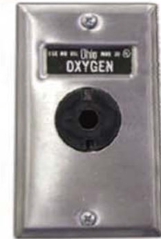
Ohmeda Diamond 1