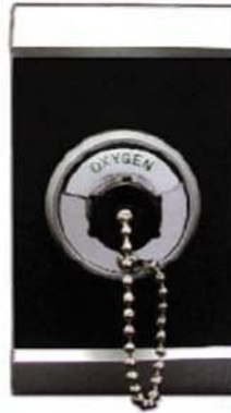
Medstar / Oxequip